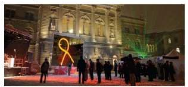
The Federal Office of Public Health and its partner organisations present the new preve on HIWAIDS and other In front of the F ent in Beme on World AIDS Day. With a light show, pop music, poetry and an AIDS walk in ice-cold temperatures and snow flumes.

Federal Government is obliged to issue regulations for combating transmissible or life-threatening diseases. The NPHS