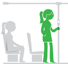
On the way to work