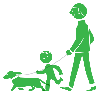
During leisure time