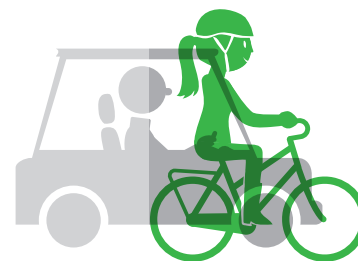
On the road