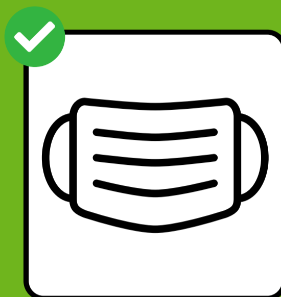
Wear a face mask.