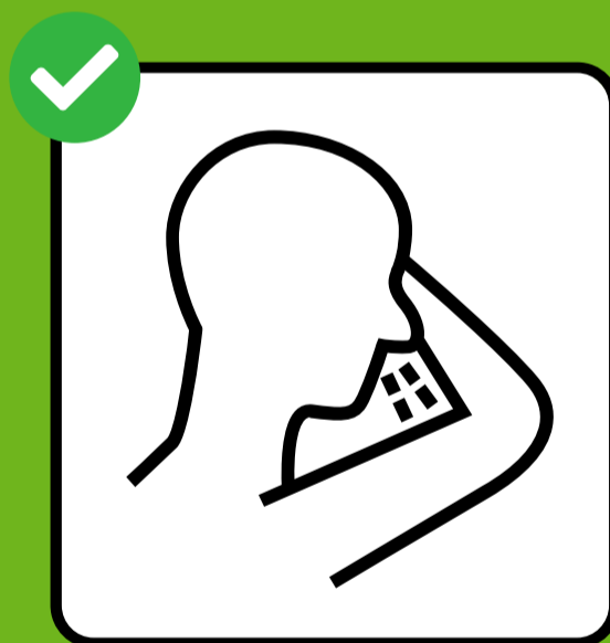
Cough and sneeze into a tissue or the crook of your arm.