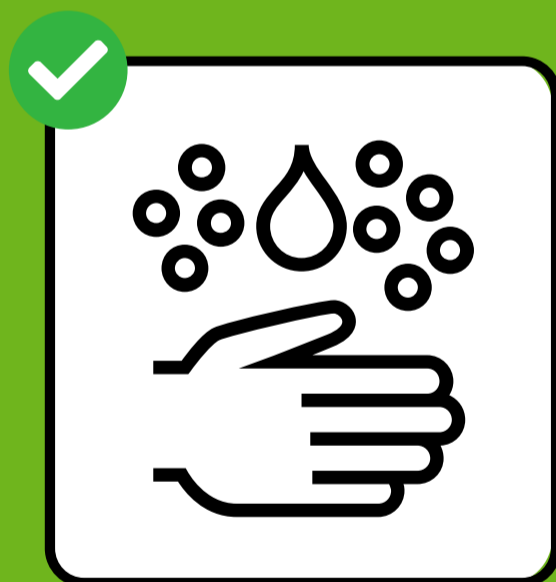
Wash or sanitise your hands thoroughly.