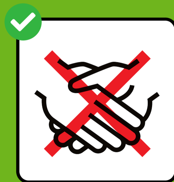
Avoid shaking hands.